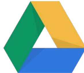
Google Drive (Android)