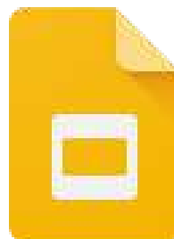
Google Slides (Android)