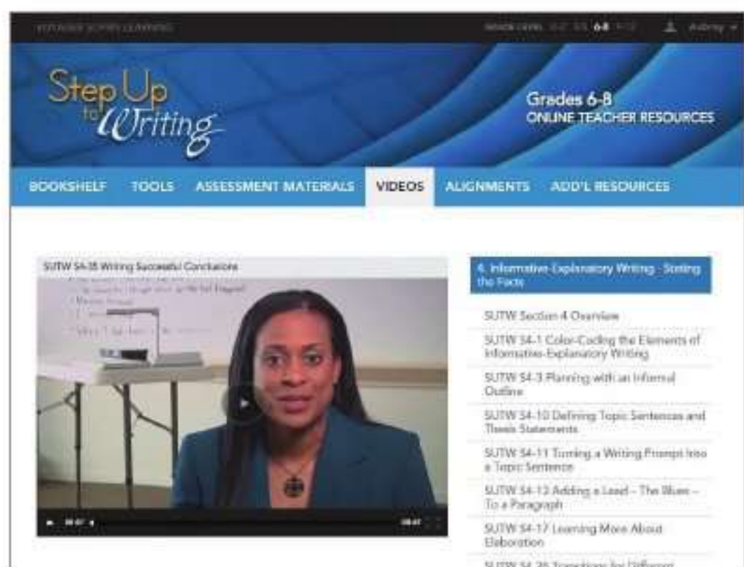
Professional Development Videos