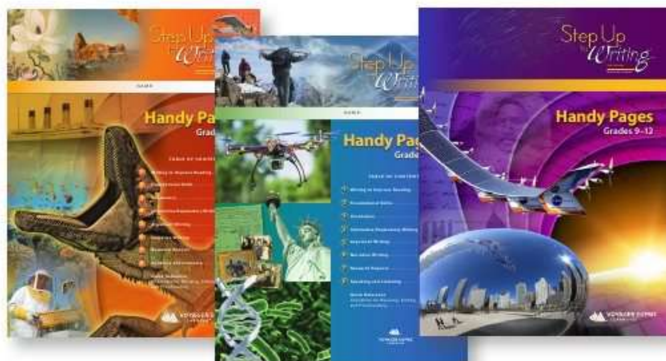
Student Materials Reinforce Instruction