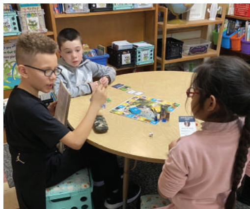
The Smithsonian Programs allow students to engage with content through inquiry and hands-on, minds-on experimentation.

The State of Connecticut is one of 44 states that have adopted NGSS-based standards. 1 As such, the Connecticut Next Generation Science Assessment is aligned to the NGSS and, according to an interview with the chief performance officer at the State Department of Education, is unlike previous science assessments. 2 Old assessments may have asked students to regurgitate content taught in a lecture-style setting. The new assessment evaluates whether the student is able to use science and engineering practices to demonstrate understanding of core ideas and crosscutting concepts. 3