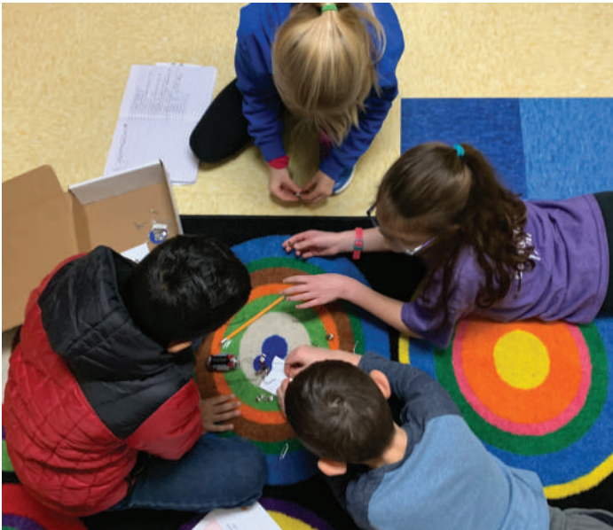
Students drive more of the instruction than they realize in 3-dimensional lessons.