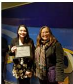
Celebrate your AVID student!