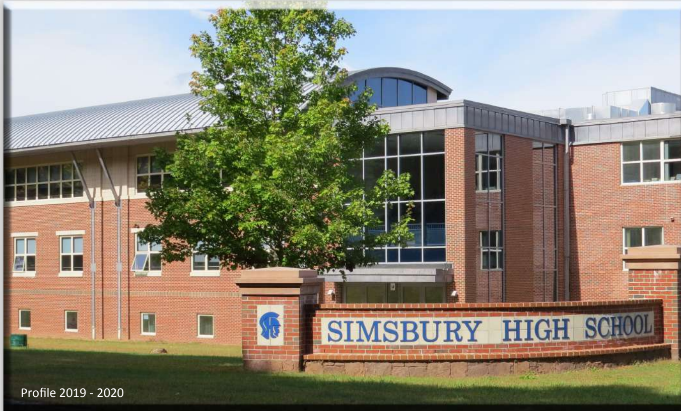
Profile 2019 - 2020