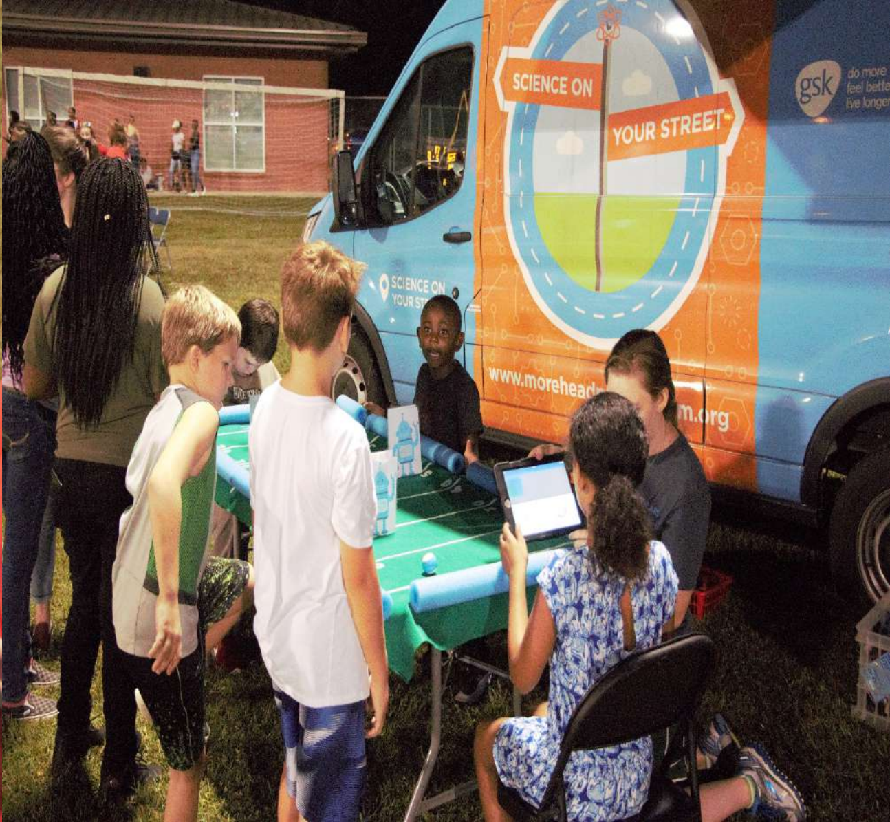
SEPTEMBER 21, 2018 – UNC SCIENCE TAILGATE - GCHS