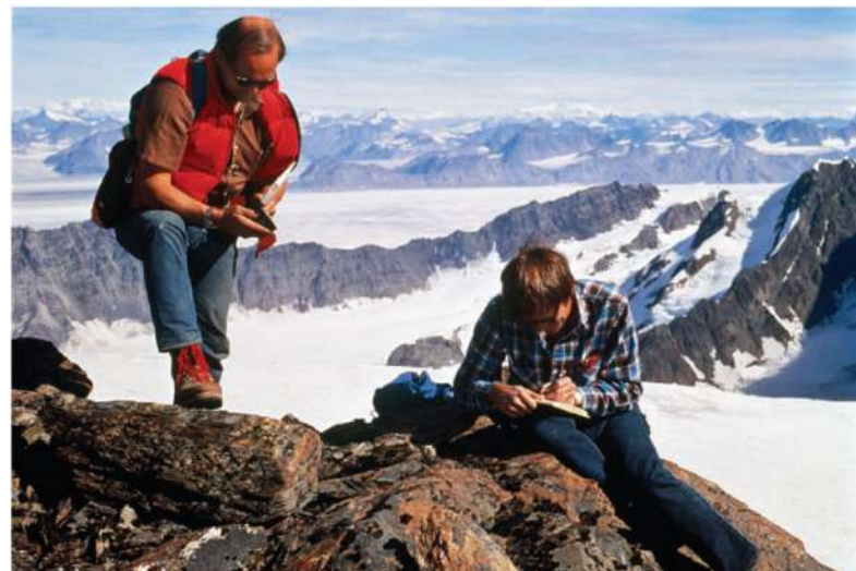
Nancy Simmerman/Getty Images