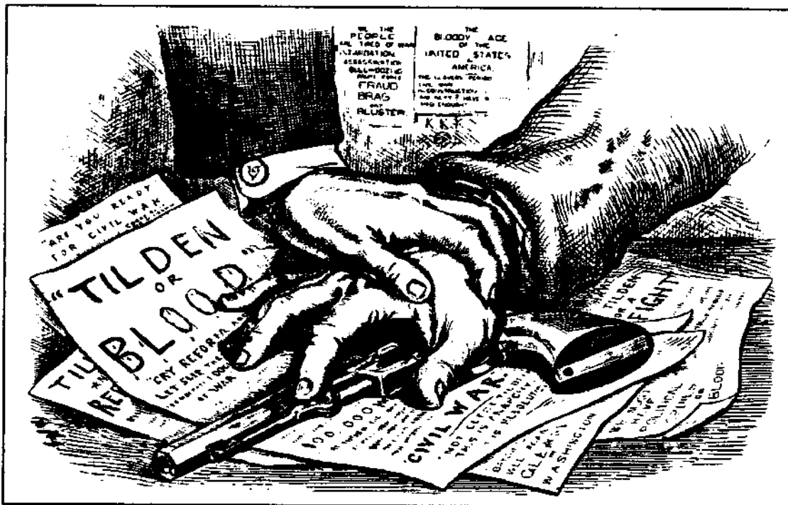
Cartoon by Thomas Nast, 1876