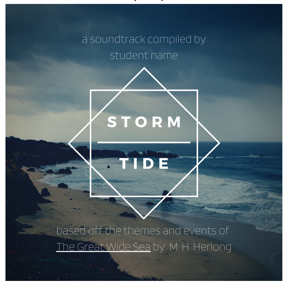
STORM TIDE A soundtrack compiled by Student Name

Student Name Teacher Name Pre-AP English 8 Date