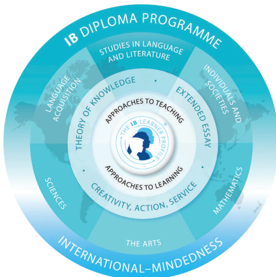
Figure 1 Diploma Programme model

The course is presented as six academic areas enclosing a central core (see figure 1). It encourages the concurrent study of a broad range of academic areas. Students study: two modern languages (or a modern language and a classical language); a humanities or social science subject; an experimental science; mathematics; one of the creative arts. It is this comprehensive range of subjects that makes the Diploma Programme a demanding course of study designed to prepare students effectively for university entrance. In each of the academic areas students have flexibility in making their choices, which means they can choose subjects that particularly interest them and that they may wish to study further at university.