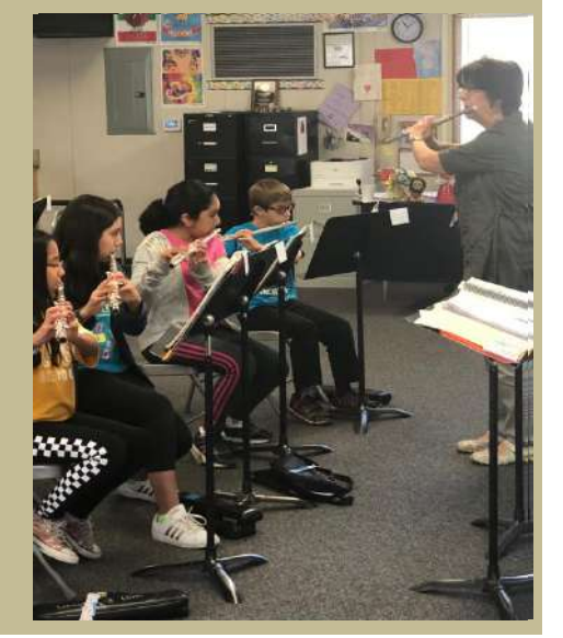
If you can read any of this, Thank A Music Teacher!