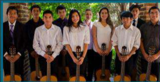
Madera South High School guitarists