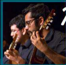
FCC student guitarists