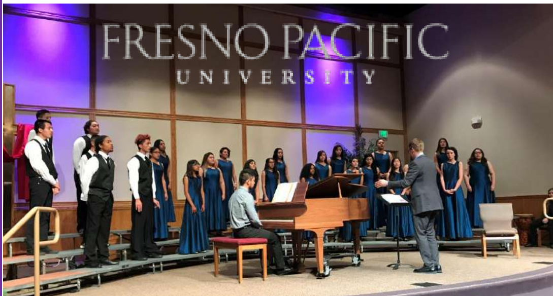
(Above) MHS Choir participated in the Fresno Pacific Choral Festival.