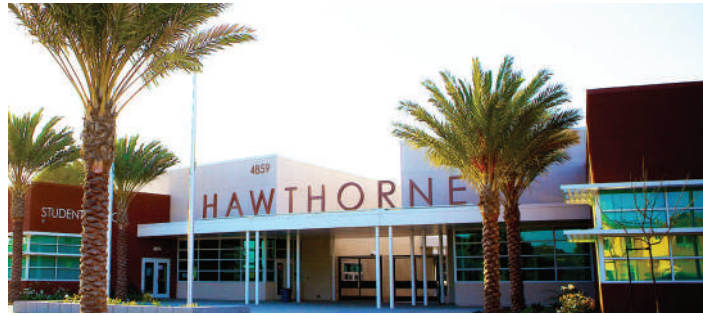
HAWTHORNE HIGH SCHOOL - STUDENT SERVICES, MEDIA CENTER & SCIENCE BUILDINGS