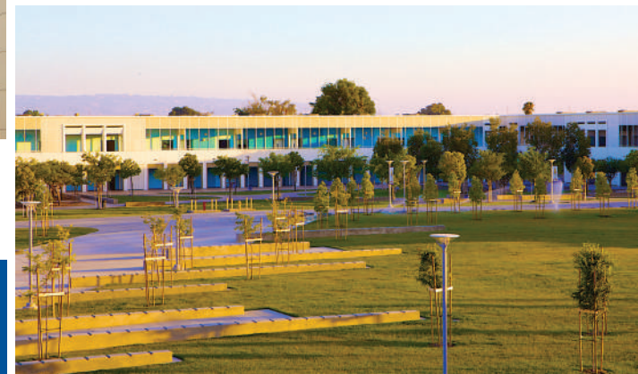
Leuzinger High School Arts & Science Center