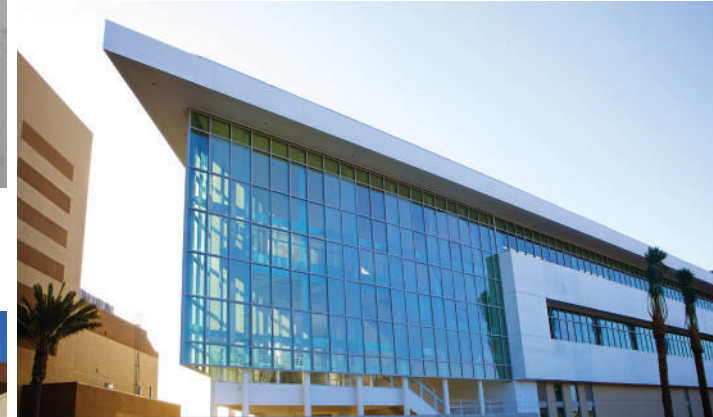
Lawndale High School Student Services & Administration