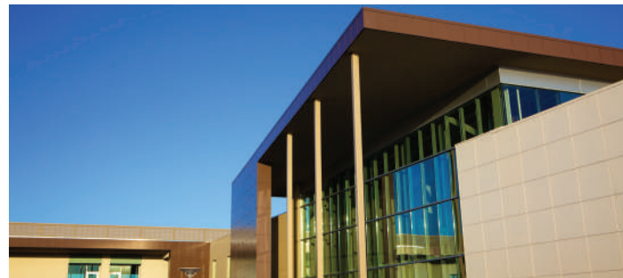
LEUZINGER HIGH SCHOOL - HOSPITALITY & CULINARY ARTS ACADEMY, LABS & CLASSROOMS

14901 S. Inglewood Ave., Lawndale, CA 90260 (310) 263-3200 www.Centinela.k12.ca.us