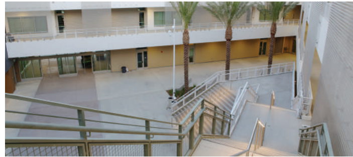
LAWNDALE HIGH SCHOOL - ADMINISTRATION, STUDENT SERVICES & CLASSROOMS