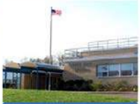
Middle Gate Elementary