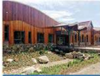
Sandy Hook Elementary