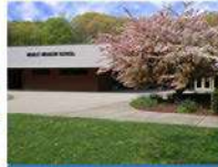
Head O'Meadow School