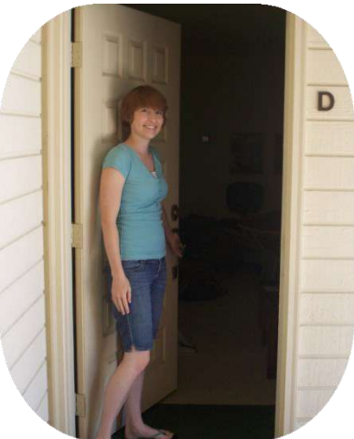
The door was open.