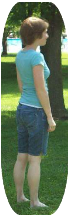
Then, she . (stop)