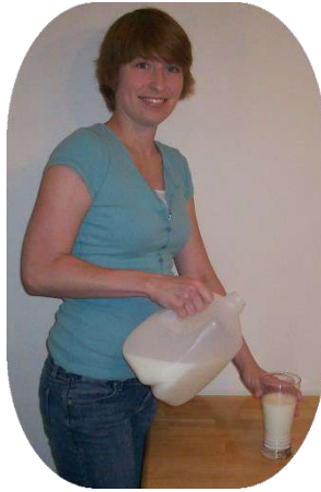
So, she a glass. (pour)