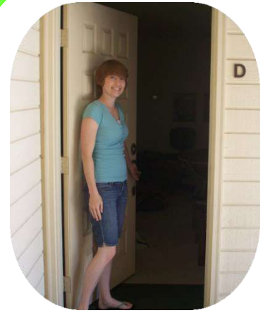
Then, she the door. (open)