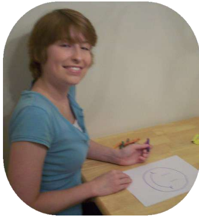
Then she _____ a picture. (draw)