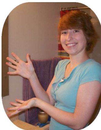
So she them. (wash)