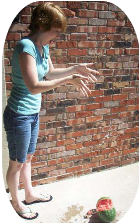
Oh no! She it! (drop)