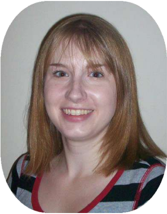
So, she it. (brush)