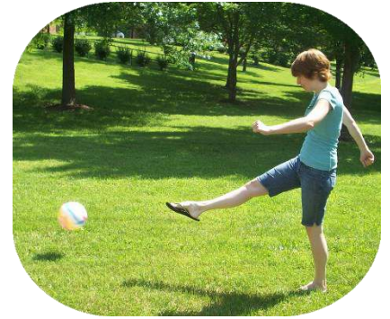
Then, she _____ it. (kick)