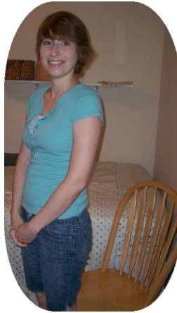
Then, she _____ up. (stand)