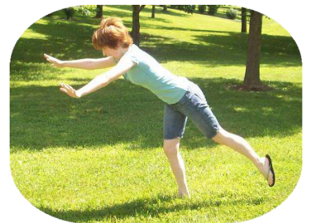
Oh no! She _____! (fall)