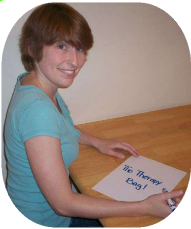
Then, she ___ words. (write)