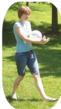
Look! She _____ the ball! (catch)