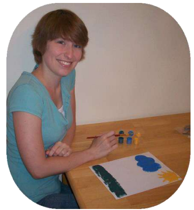
Then, she a picture. (paint)