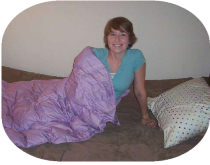
It was time to go to school, so she up. (wake)