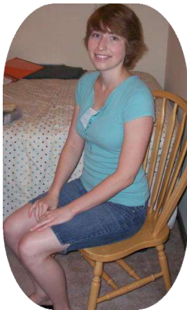
Then, she _____. (sit)