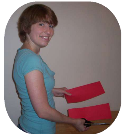
Then, she _____ the paper. (cut)