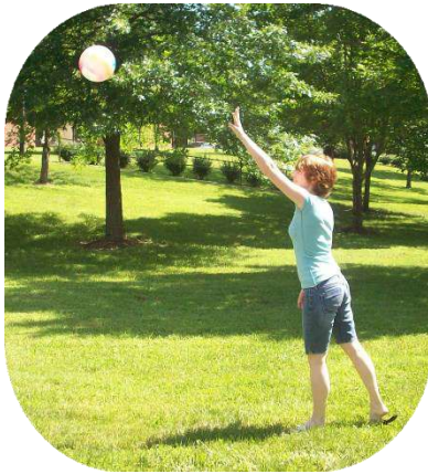
Then, she _____ it. (throw)