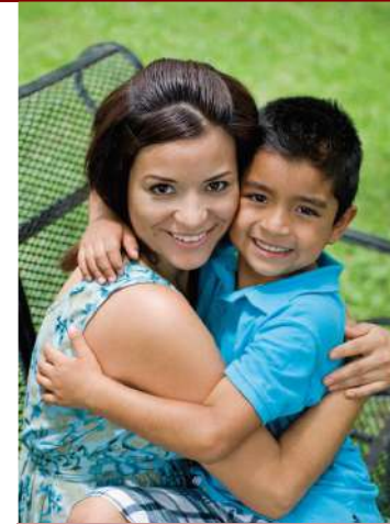
Parents' Guide to:

715 West Platte Avenue Fort Morgan, Colorado 80701 Phone 970-867-5633 Fax 970-867-0262 www.morgan.k12.co.us