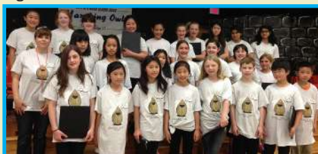
Harmonies earn Choral Ensemble platinum award

Our Jazz Band distinguished itself by earning a gold award. Having elementary school music students participate in this form of an evaluation process is unprecedented.