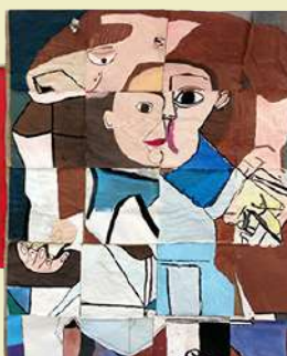
The study of Pablo Picasso was an integral part of Artsweek. Above, the students' stunning reproduction of the cubist's "First Steps". The actual, right. One of many outdoor displays, below.