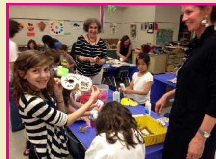
Mask-making: just one of the activities on Arts Night where parents participate with their children

In addition to the adjudication proceedings, the spring music concert held outdoors was attended by parents and students. Special thanks go to the many teachers and staff, and the PTO who organized this one-of-a-kind event underscoring the important role the arts play in creating the culture of pride enjoyed at Beecher Road School.