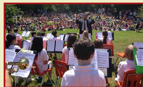
Hundreds attend spring concert held on the grounds of the BRS campus