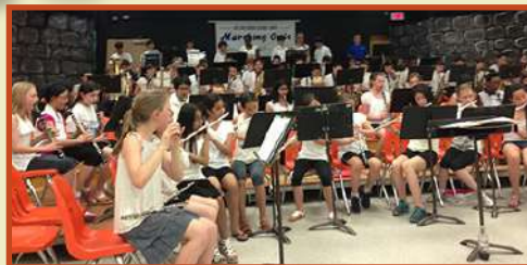
BRS Advanced Band earns platinum award

The study of Pablo Picasso was an integral part of preparing for Artsweek 6. Students learned about and created works in the cubist style including a large mural of the artist's famous First Steps .