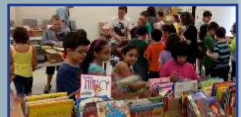
Picking out "new" books