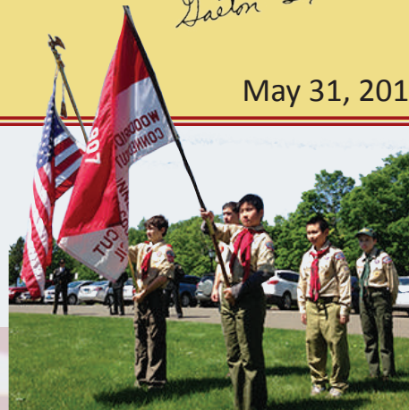
BRS Students from Boy Scout Troop 907 prepare to march in Memorial Day Parade.

These are only some of the things that I saw during one long weekend. There are many other acts of compassion, good citizenship and generosity that BRS students and families perform on a daily basis. This is another reason why BRS is so unique - a strong focus by school and family in promoting volunteerism, citizenship and character. ☺