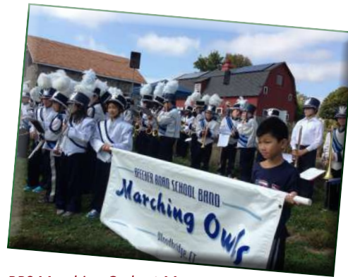
BRS Marching Owls at Massaro Farm Family Day

During the winter months, there is always the possibility of a power failure due to fallen trees, storms, etc. If power is not restored within 90 minutes, we are required to evacuate the building. (Refer to Superintendent's Parent Update of August 28, 2013 and Principal's letter of November 8, 2013 for details of evacuation plan.)