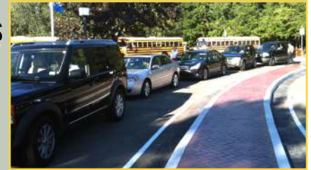
New drop-off area significantly improves safety

The new secure student drop-off area in the north parking lot has alleviated a long-standing safety concern. The traffic