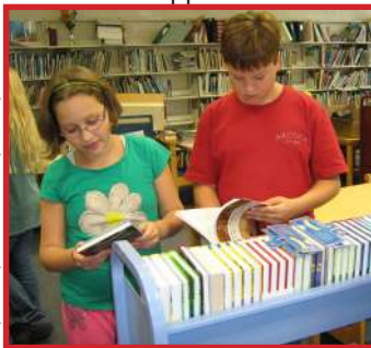
6th graders poring through the new collection of classics.

As our Intermediate readers begin to mature in both their reading ability and taste in literature, we expect these titles will serve as a bridge to the classical styles they will be exposed to in middle and high school. Reading classic literature will enhance their insight as they begin to see how elements of these original stories connect to contemporary literature and everyday life today.