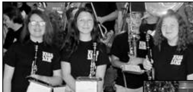
The PRIDE playlist is always upbeat.