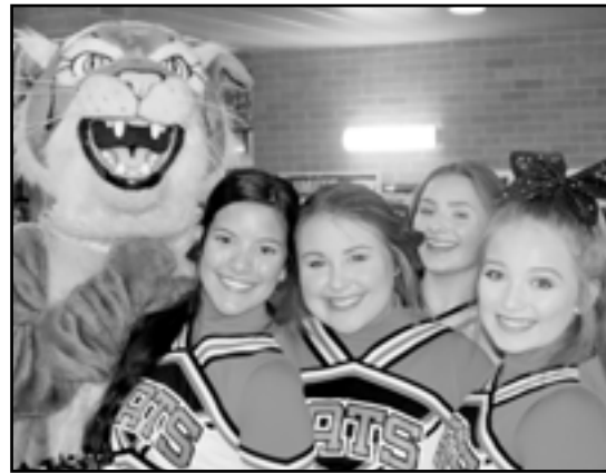
Mix 'n Match... Paws, Cheer and an Alleycat.