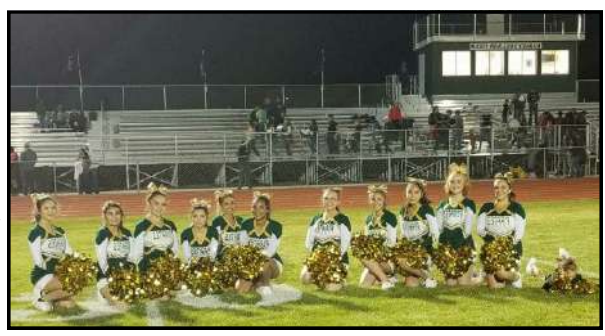
The cheer team poses at this year's first home football game.

This year, the cheerleaders have participated in fundraisers and solicited donations in order to compete at state, and they are grateful to the community for their continued support. Their future fundraisers include selling popcorn and chocolate. After setting money aside for competition, the team decided to purchase new warm-ups to look more united as a team. The warm-ups include new bows.