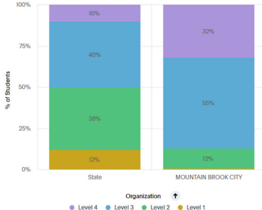
Summary of Performance by State and District