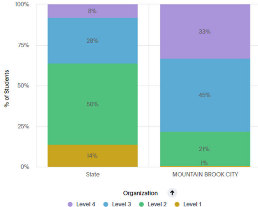
Summary of Performance by State and District