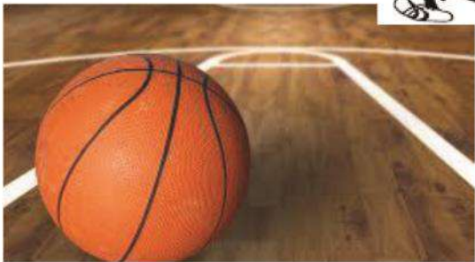
Basketball Girls & Boys