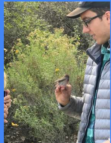
4th grade bird banding field trip