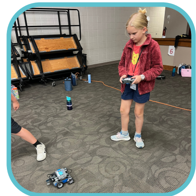
5th Graders practice driving robots.