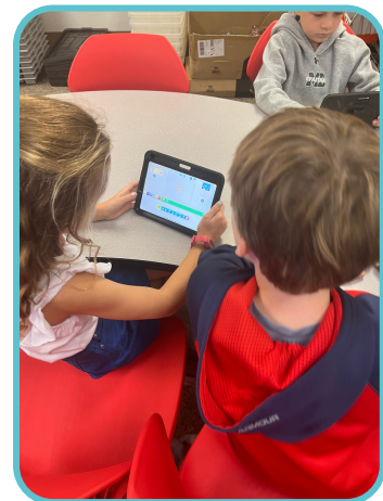
Pair programming helps develop collaboration!