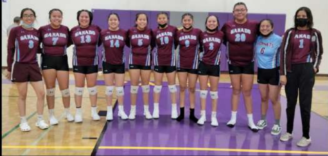
The Lady Hornets defeated Gilbert Classical Academy to advance to the 1 st round 2A Conference State Championships