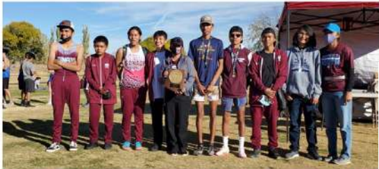
MEN'S TEAM CHAMPIONS