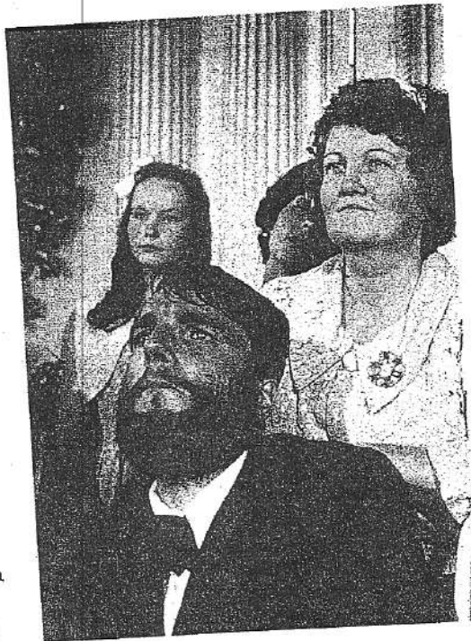
▲ Critical Viewing Look at this still from the movie My Left Foot . Describe the feelings the actress playing Christy's mother is showing in her expression. [Interpret]

conviction (ken vik' shən) n. : Strong belief