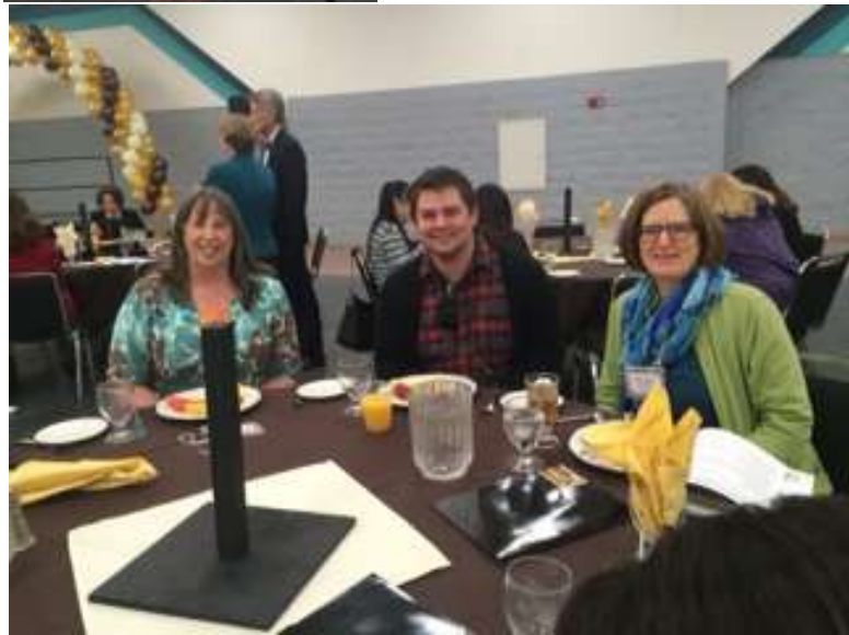
Opening Breakfast at the Region 7 Arts In Ed. Summit