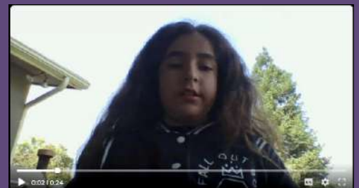
"Learn new songs."