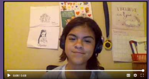
"Make new friends."