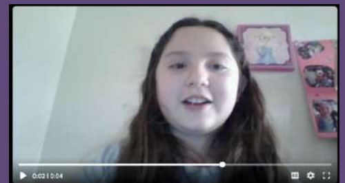
"Learn different notes."