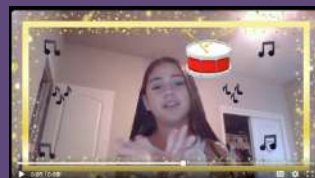
"You get to sing and you get to be yourself."