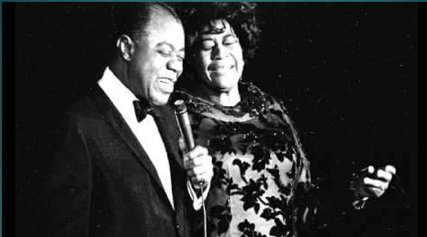
Ella and Louis Armstrong Summertime