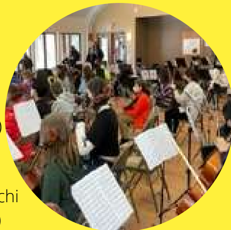
Elementary CMEA Northern Regional Festival