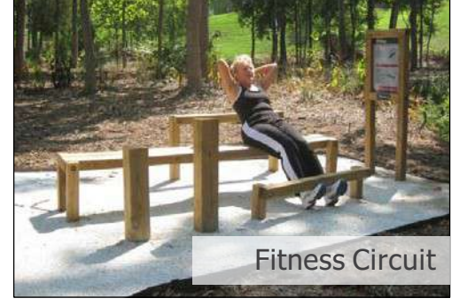
Additional Potential Elements

Playground Measured Running/Walking Circuit