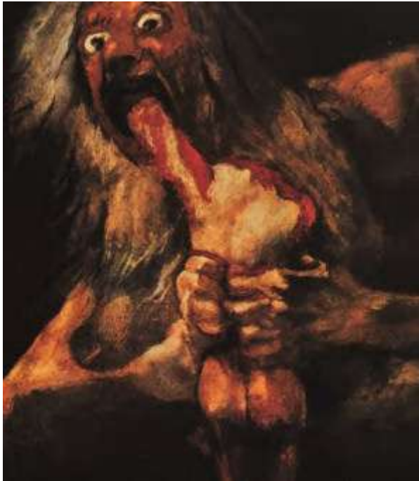
Cronos devouring his children