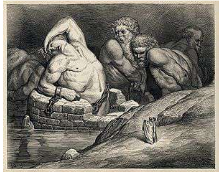
Titans imprisoned in Tartarus