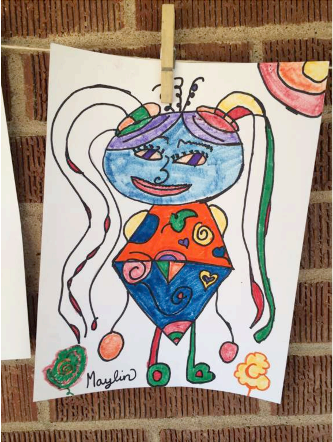
Chandler Unified School District Art Masterpiece