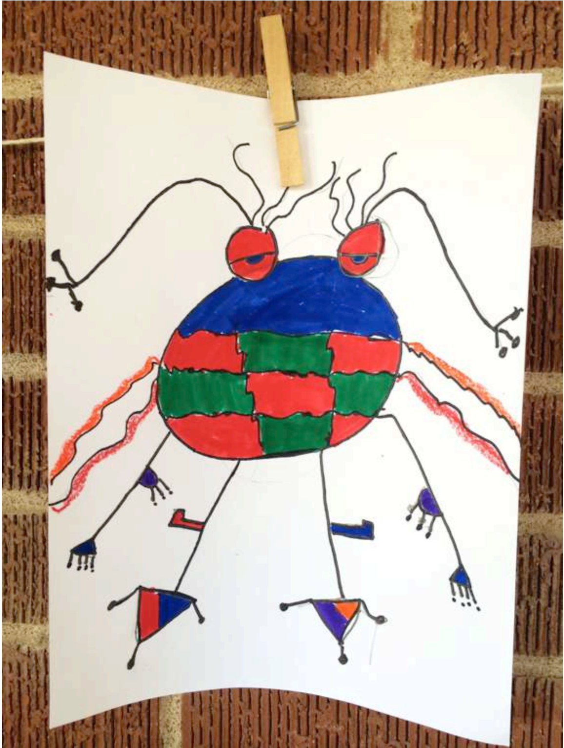
Chandler Unified School District Art Masterpiece