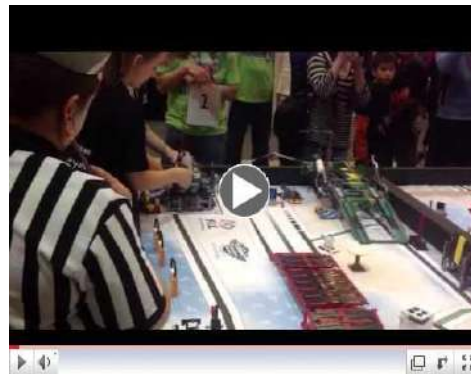
Untitled-1 Team Robot Run at First Lego League World Champs