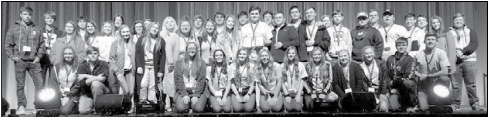
The Gang: WRHS squad representing at state FBLA. Each and every one of you did an amazing job and we're all proud of you!