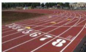
Boys & Girls Track