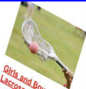
Girls and Boys Lacrosse