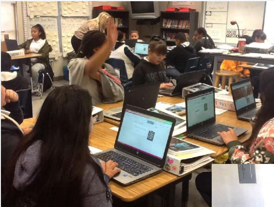
Students at Jackson learn to use the Amplify ELA program.