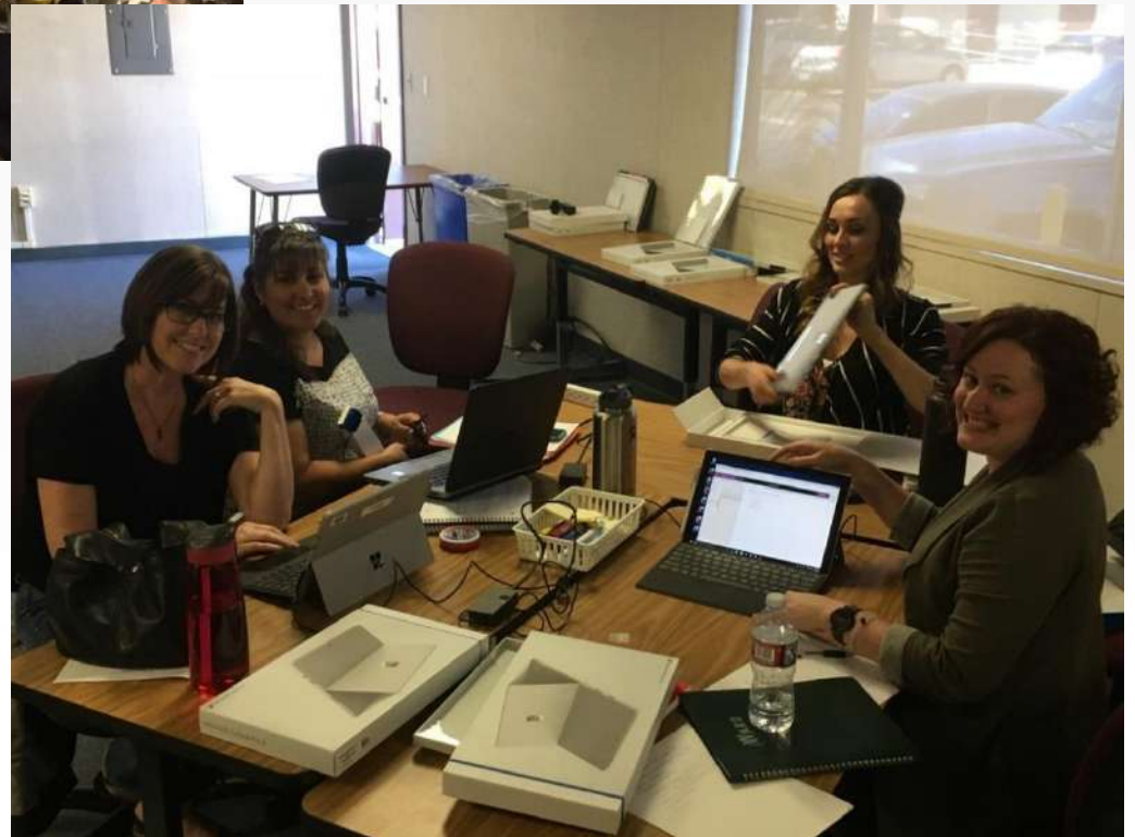
Teachers being trained to use Microsoft Surfaces for instruction.