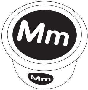
(outside of lid)

Setting up the tubs is easy! First, apply the labels. Each tub gets three different, corresponding labels. To avoid mixing up the labels, we suggest you apply all three labels to the lid and side of each tub before moving on to the next tub. Place the small red letter label on the side of the tub. Place the large blue letter label on top of the lid, and attach the label with the list of miniatures to the inside of the lid.