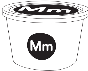
(side of tub)