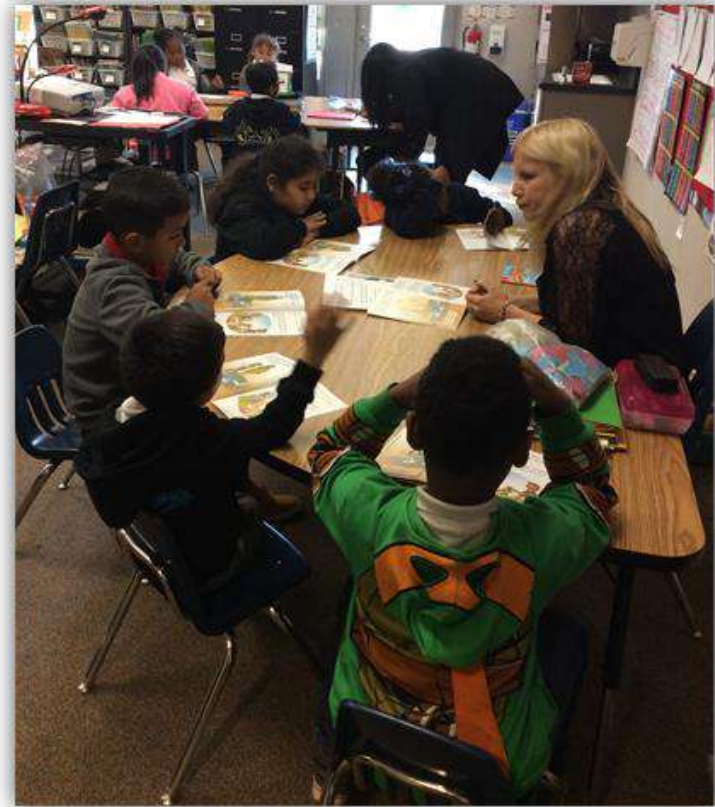
Students using leveled readers during differentiated small group instruction