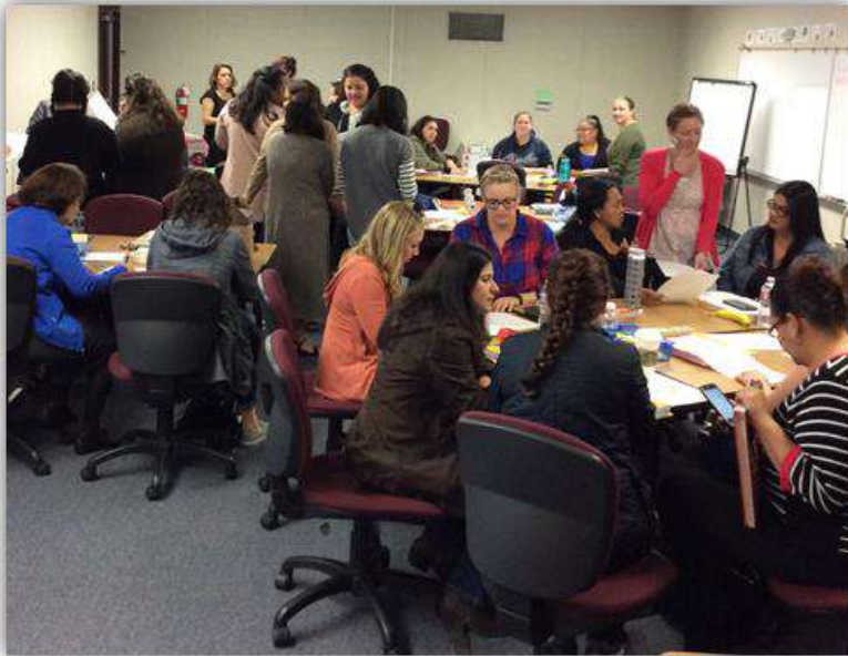
Grade 1 teachers collaborating on Foundational Skills