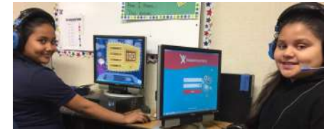
New technologies to advance their learning in English and Spanish