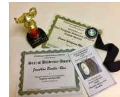
Awards for Achievement in Dual Language Immersion at the annual Gran Celebration.

English Learner (EL) students in the Dual Language Immersion program have the same opportunities to reclassify to Fluent English Proficient (R-FEP) as EL students in other programs.