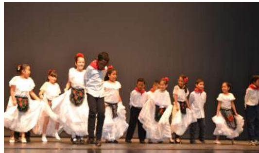
Dual Language students at "La gran celebración"