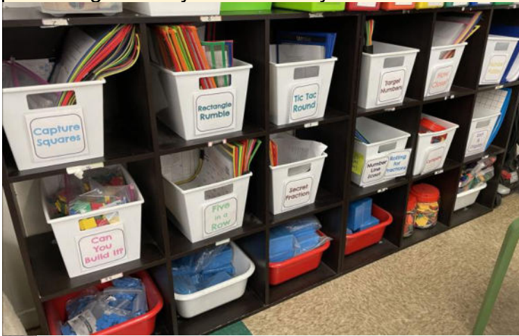
How I organize my centers in my classroom.