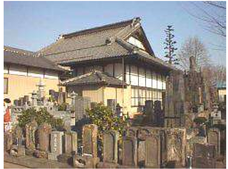
Japanese Buddhist Temple