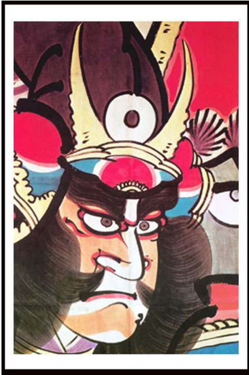
A cartoon Shogun