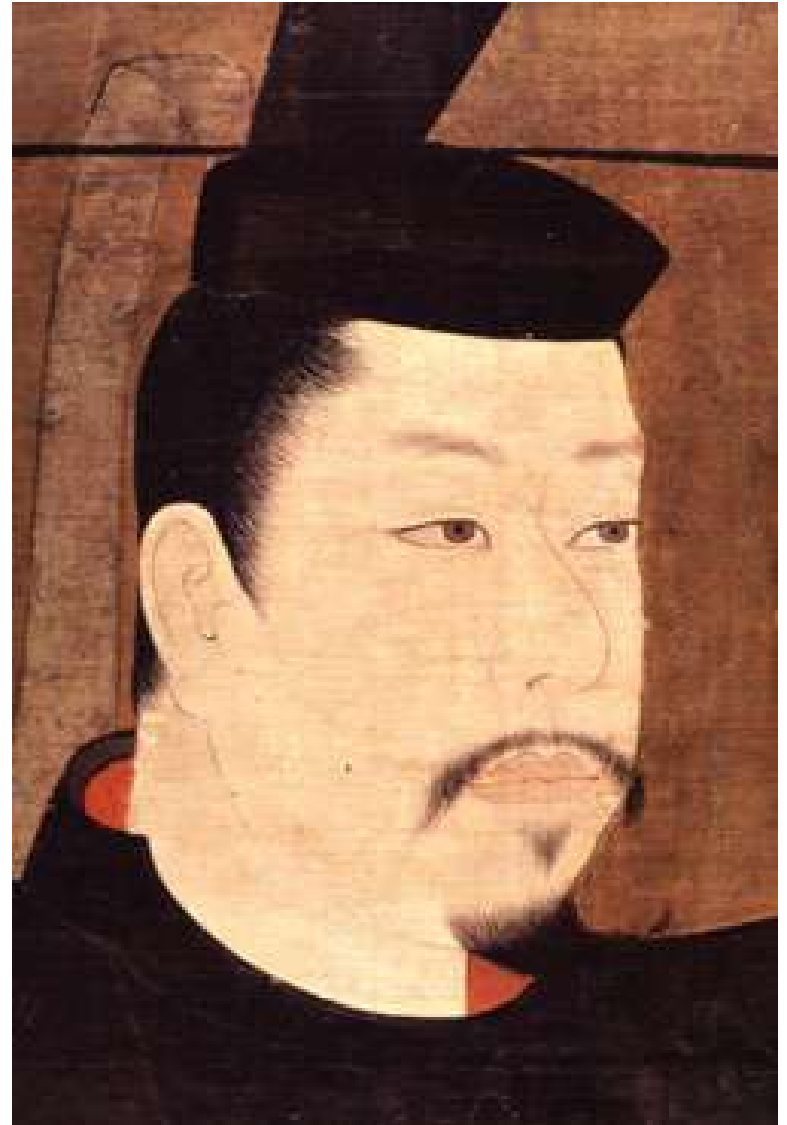
Yoritomo, 1 st Shogun