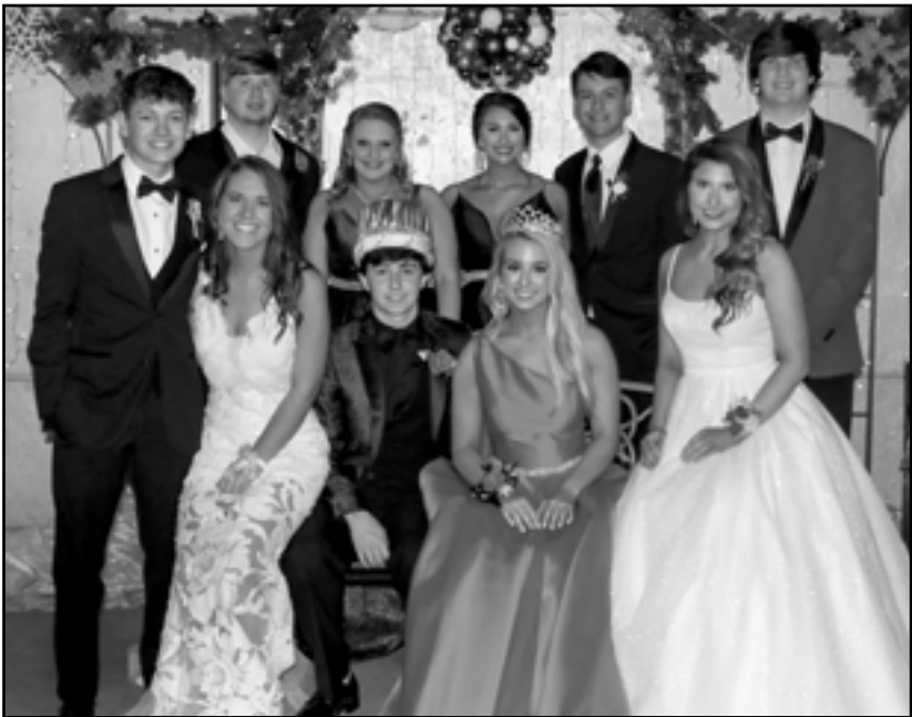
Winter Ball Royalty