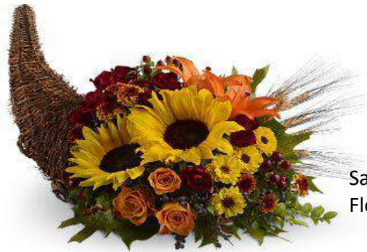
Sample image – Flowers will vary

Hosted by: Bethel Girl Scout Cadette Troop 50712