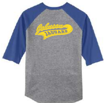
Heather Grey/Royal 3/4 Sleeve 100% Ringspun Cotton Jersey with Johnson Jaguars design printed in Golden Yellow on front.