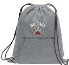
17.75 H x 14.5 W Athletic Heather 50/50 "sweatshirt" Cinch Pack with BETHEL Paw Print Design embroidered on Front.