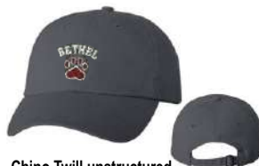
Chino Twill unstructured, low profile, Charcoal cap with self-fabric tri-glide buckle closure with BETHEL Paw Print Design embroidered on Front.