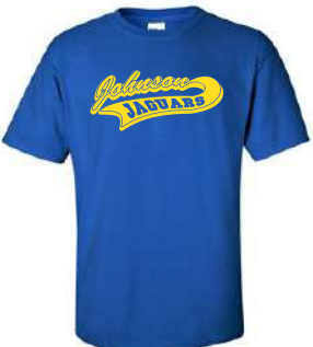
Royal Blue Short Sleeve 100% Cotton T-Shirt with Johnson Jaguars design printed in Golden Yellow on front.