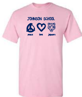
Light Pink Short Sleeve 100% Cotton T-shirt with Johnson Peace Love design printed in Royal Blue on front.