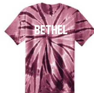
Maroon Tie-Dye Short Sleeve T-Shirt with BETHEL design printed in White on front.