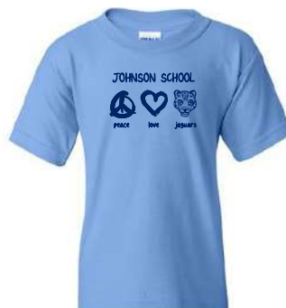
Carolina Blue Short Sleeve 100% Cotton T-shirt with Johnson Peace Love design printed in Royal Blue on front.