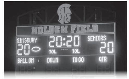
To highlight and recognize the Class of 2020, on Friday, May 8, 2020, the scoreboard lights on Holden Field were lit up from 20:20pm (8:20pm) for 20 minutes.